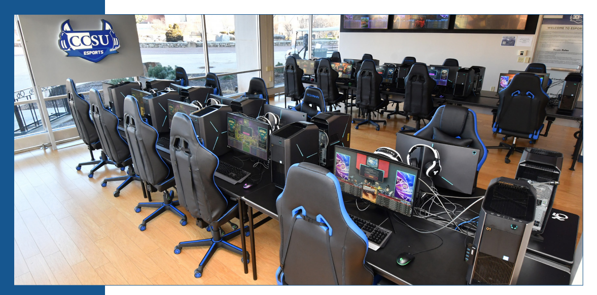
While capacity will be reduced to accommodate social distancing, the eSports Center is ready for the return to full campus operations.

Before the shutdown, the eSports Center hosted the Play VS State of CT eSports finals, undergraduate classes, and five competitive varsity teams. During COVID, the eSports Varsity Teams practiced and competed using their home computers.