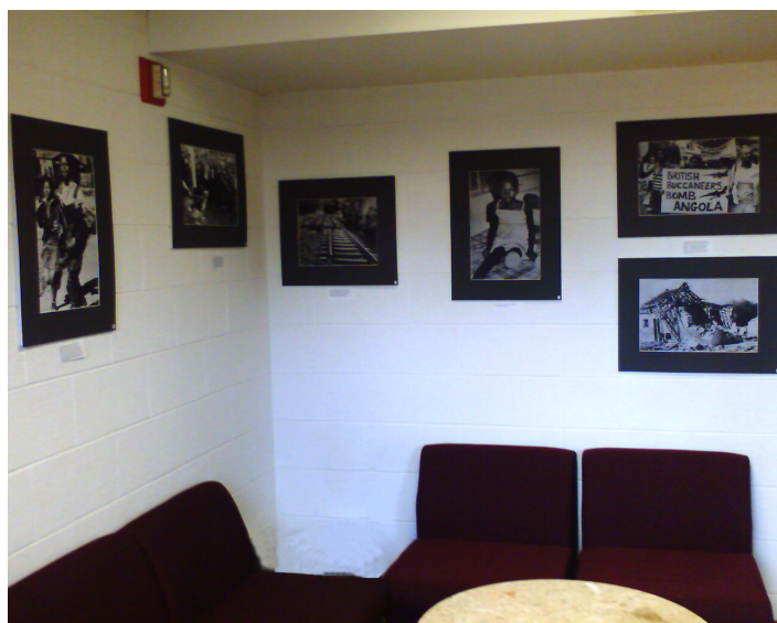
Images from of Apartheid exhibit on display at the Center for Africana Studies lounge area