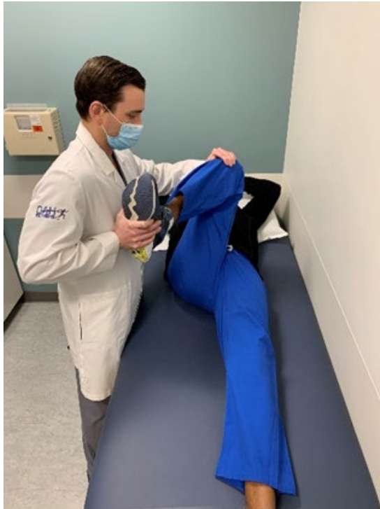
Anterior impingement test (FADIR)