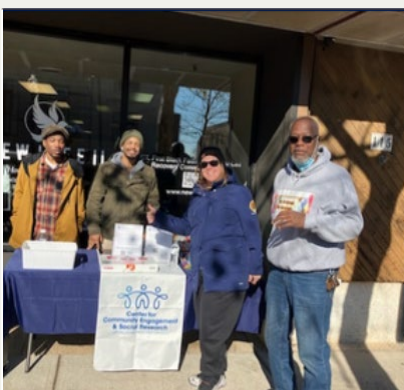
New Life II: Winter Gear Distribution