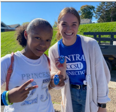
Rock Painting at NB Fire Safety Day