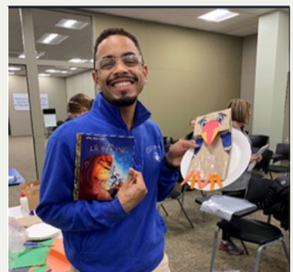
Community Engagement Faculty Workshop