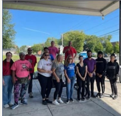
North Oak Neighborhood Clean Up