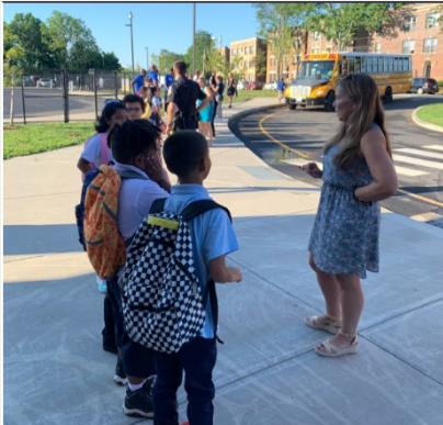
Smalley Elementary: First Day of School