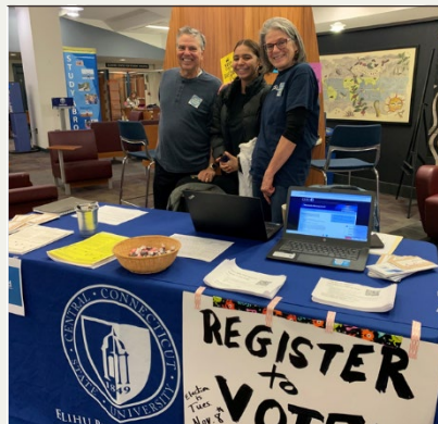
Voter Registration Day