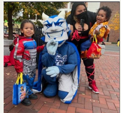
New Britain Trick or Treat Safe Zone